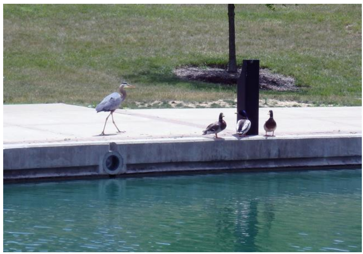
Figure 2. Wading and water fowl using the non-native side of Loch Norse.