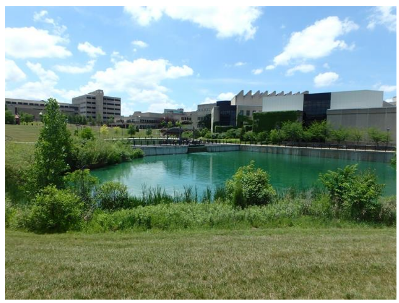
Figure 3 . View looking southwest toward Loch Norse and main campus. Native vegetation in foreground (Sass 2015).