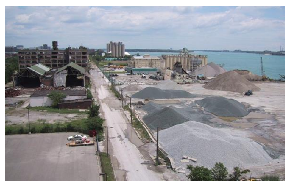
Before comparison: Looking east over Atwater Street, at the site that will become Lowland Park. Behind the aggregate stockpiles and silos is the arbor (not seen). The site offered no or minimal species diversity.